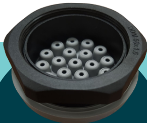
Entry System for Non-Terminated Cables