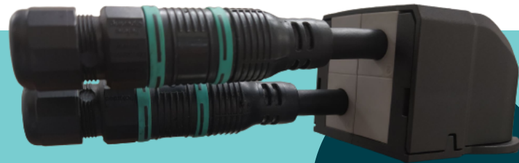
Splittable Cable Glands with Metric Thread