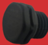
Gore Vent Gland 4L/min Size: M12x1.5 Available in Grey