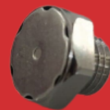
Gore Vent Gland 1.6L/min Size: M12x1.5 SS316

The products covered are designed to maintain the overall enclosure IP rating. Built to increase performance and lifetime of your sensitive internal electronic equipment.